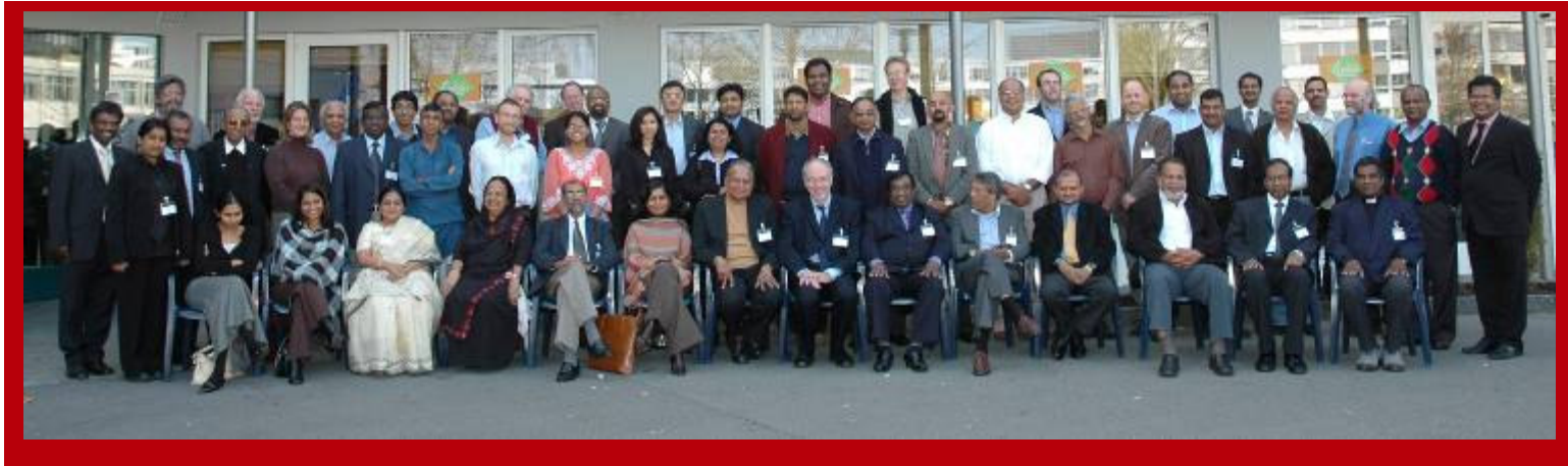
The seminar brought together a range of Tamil, Sinhala, Muslim and international academics and activists.